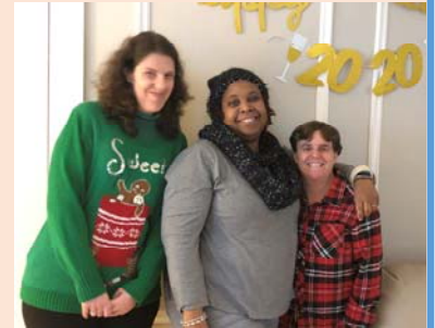
Waiting for guests to arrive.