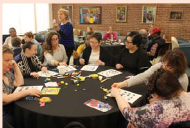
JCL friends playing Chanukah bingo.

The JCL family really knows to how celebrate the holidays! Our Judaic Programs hosted a Chanukah party at the JCC. Attendees played Chanukah Bingo, decorated paper dreidels, shared latkes, and sang songs.