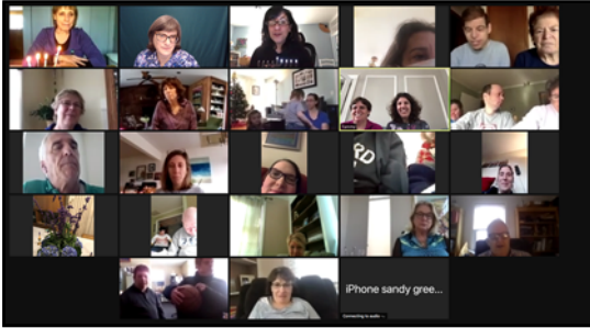
JCL Hanukkah event on Zoom.